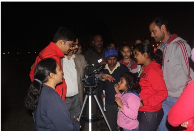
Observing the Moon