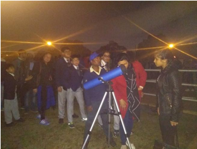
Observing the moon through a telescope