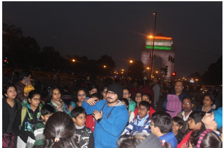
Educator explaining the eclipse