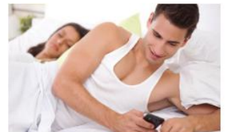
This is how women cope on discovering an emotional infidelity!