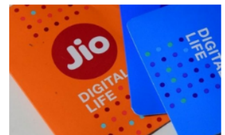
Jio offers MASSIVE 224GB data at throwaway price