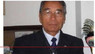
Nagaland political crisis deepens, CM sacks 4 ministers