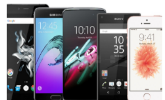
GST made these SUPER smartphones cheaper for you! cheaper for you!