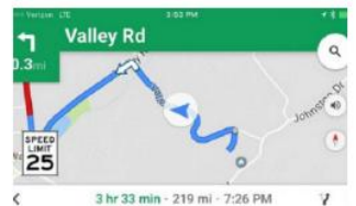
Google Maps speed limits available only in these two areas