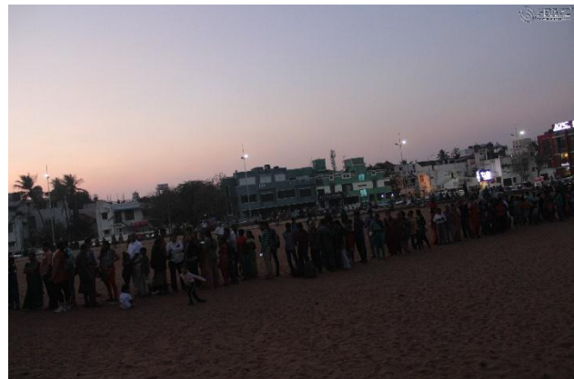
The crowd pulled up to observe the eclipse through telescope