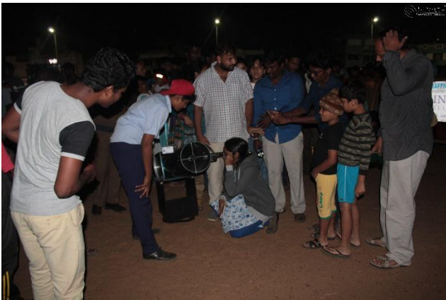
Student volunteers helped the public to observe the Eclipsed Moon