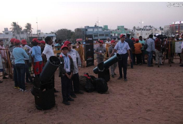
SPACE Team and student volunteers ready for the Eclipse observation