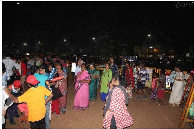
People from all age groups had turned up to observe the eclipse