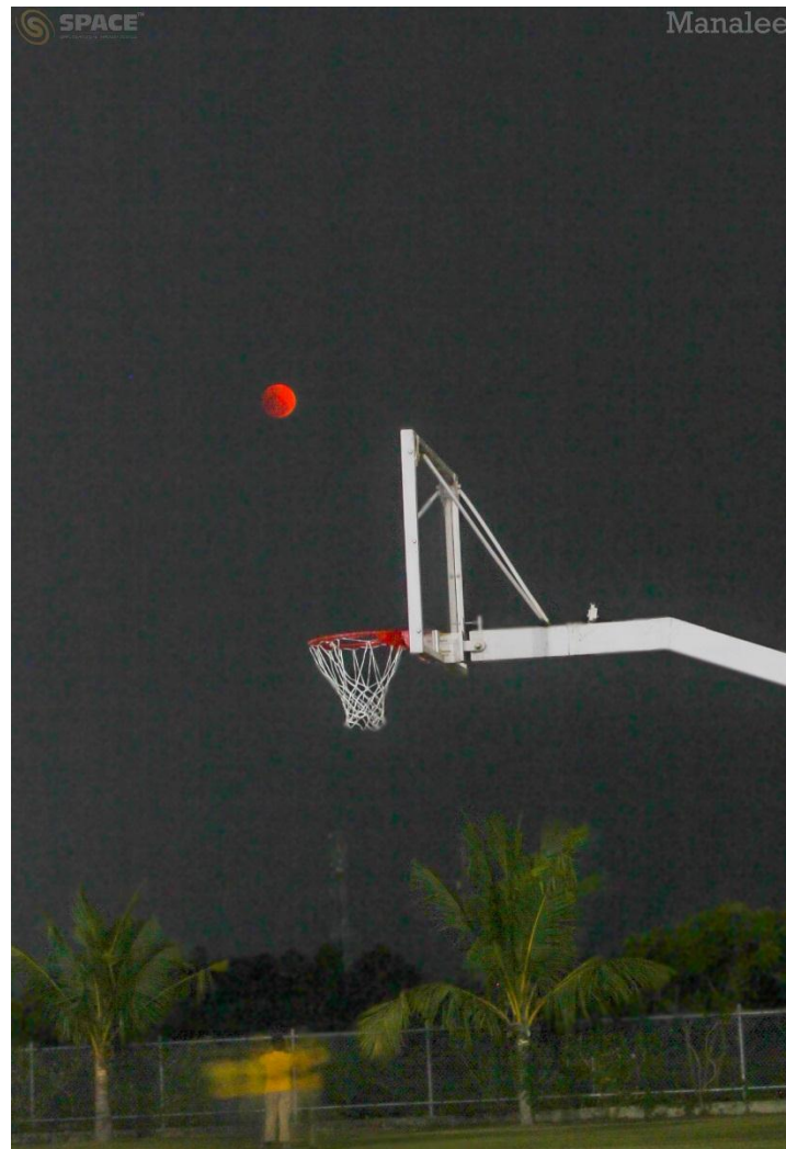
Eclipsed Moon over a Basketball Hoop