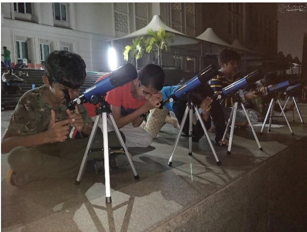
Astronomy Club members from HUS, Egattur set up their telescope to observe the eclipsed Moon