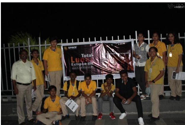
Group photo of participants of Vaels International School, Injambakkam