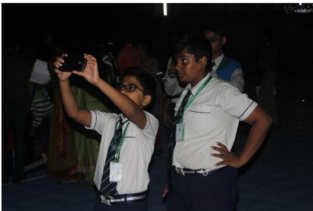
Students photographed the Eclipsed Moon