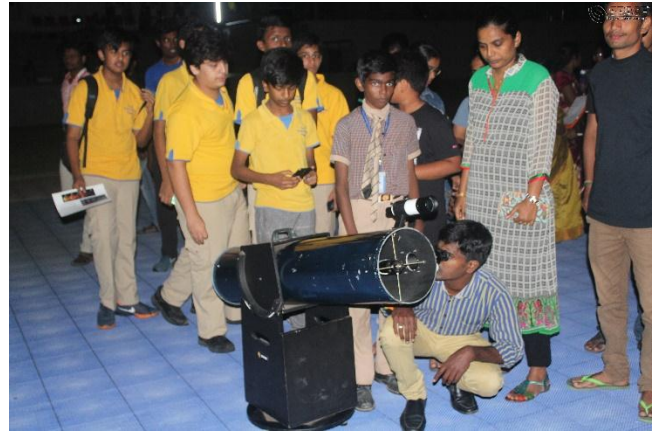
Students observed the Eclipsed Moon through telescope