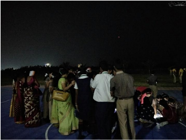
Various activities and experiments being conducted under the view of the Eclipsed Moon