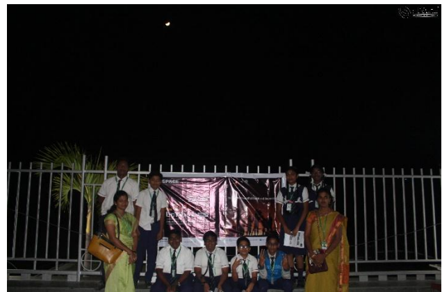
Group photo of participants of Ramachandra Public School, Kottivakkam with Eclipsed Moon