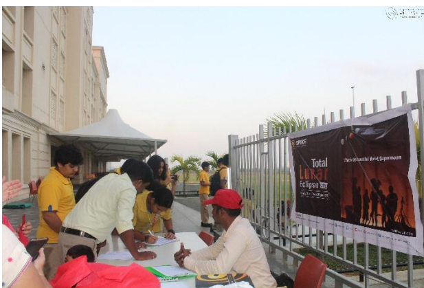
Students get themselves registered for the TLE Observation