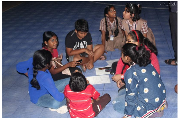
Students took part in Luminosity Activity