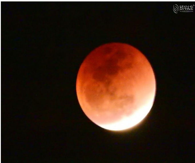
Student and parents observed Total Lunar eclipse