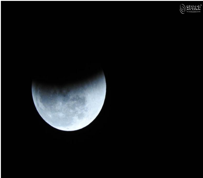
Partial Eclipsed Moon was clicked during the event