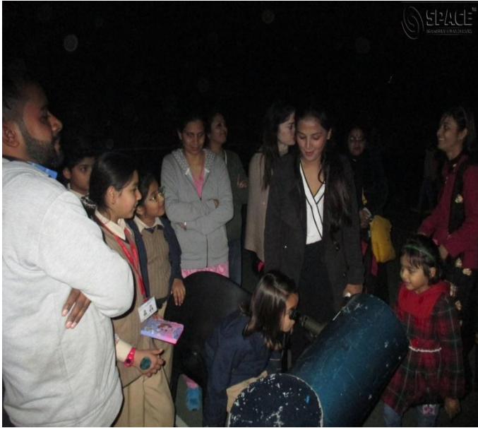
Students observed Eclipsed Moon during the observation