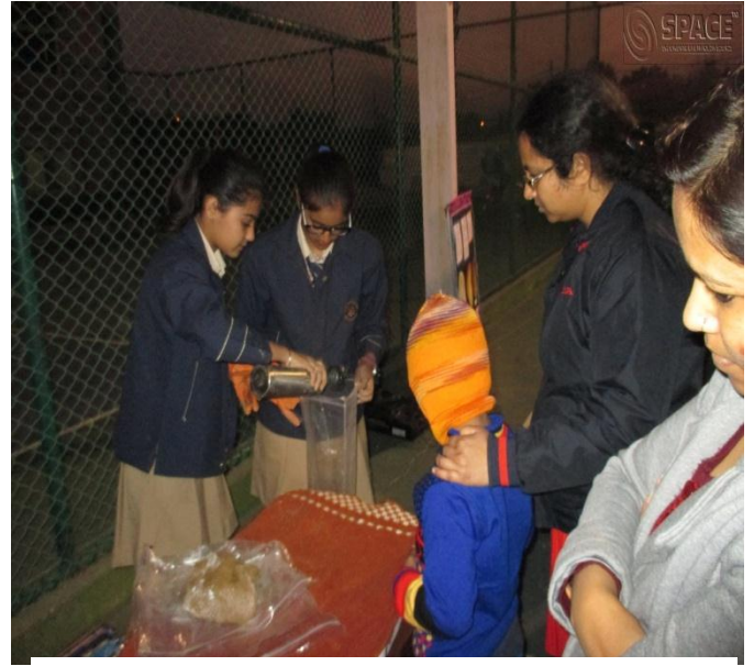
Students demonstrated comet kitchen activity during the event