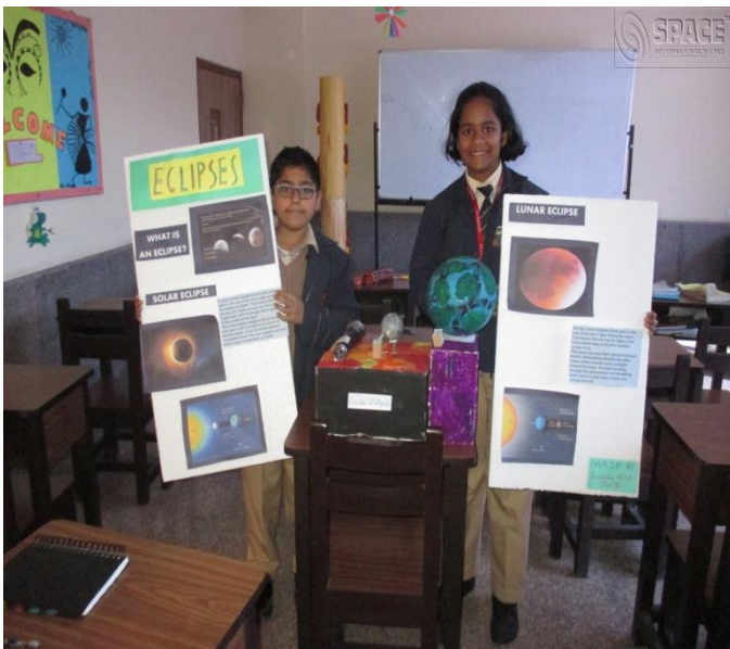
Volunteers made a model on Lunar eclipse