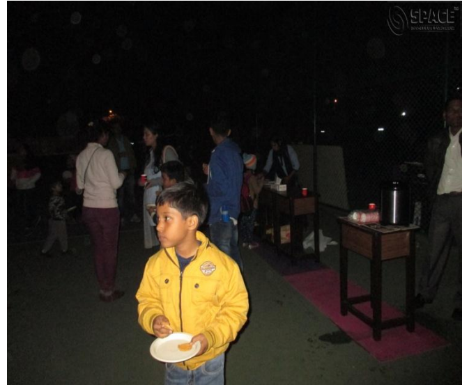
Parents and teachers broke the myth and had some eatable during eclipse