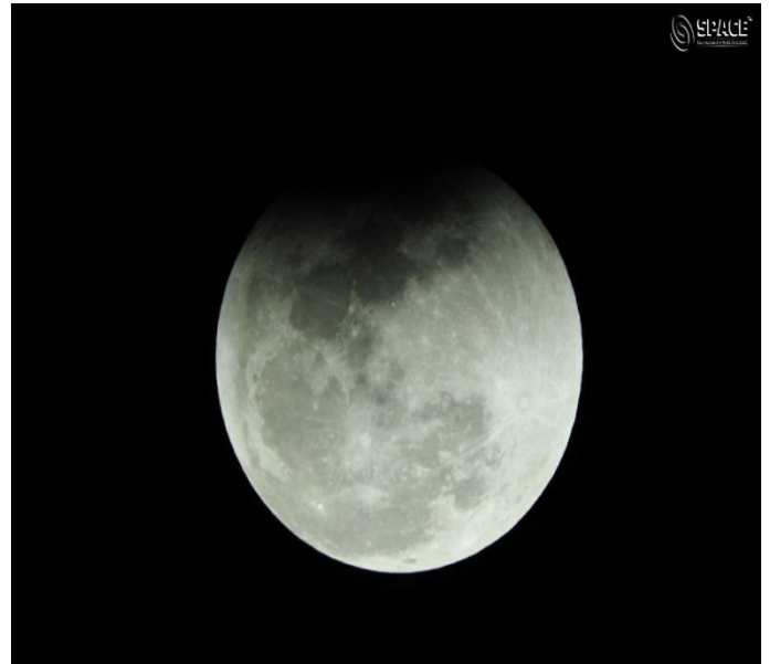
Parents enjoyed the telescopic observations of moon