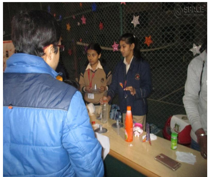
Volunteers showcased the pop rocket and launched them