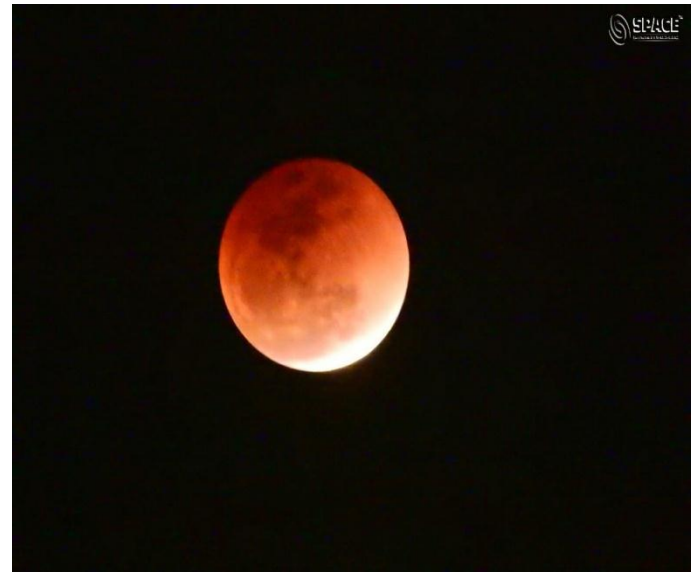
People observed the Red blood Moon