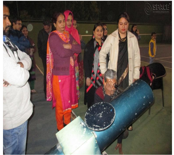
Participants of all ages observed the moon with enthusiasm