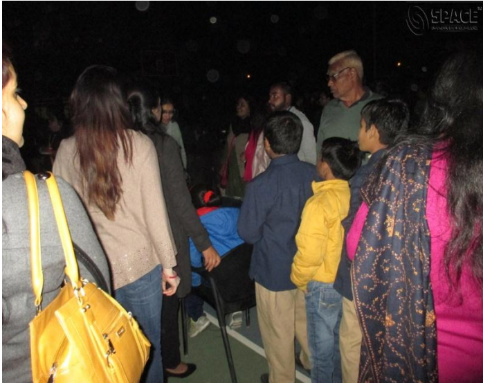
Participants observed Eclipsed Moon during the event